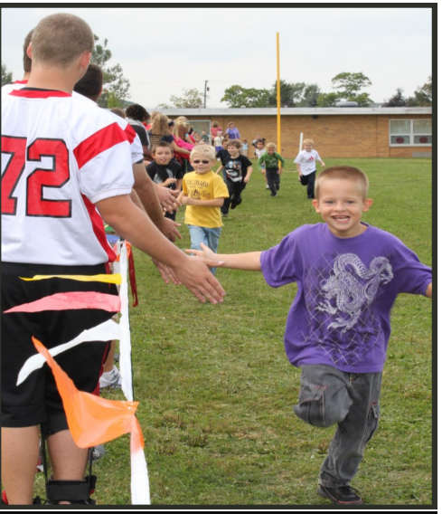
Firelands High School students cheer on elementary students as they run laps at the Falcons on the Fly Kick-Off Event September 14th. Falcons on the Fly is a walking/running program that takes place at Firelands Elementary during recess. Thanks to the FES PTG for making this program possible!